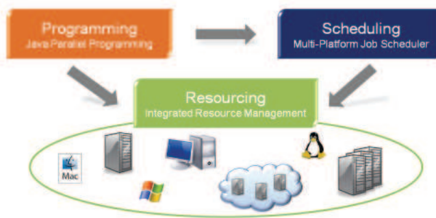
Figure 1: ProActive Parallel Suite.

We introduce the concept of Node Source which associates the method of acquisition of computing resources with the policy determining when these resources have to deploy or to be released. Node sources allow a company to have business driven management of their computing power. New resources can be automatically acquired at any given time, and acquisition can be automatically triggered according to the load